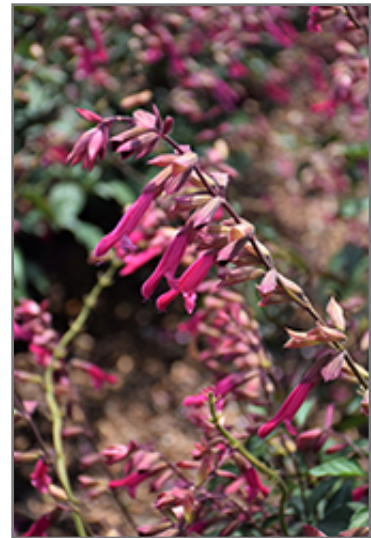
Wendy's Wish Sage flowers

Wendy's Wish Sage is recommended for the following landscape applications;