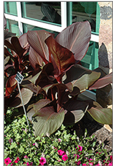
Tropicanna Black Canna

This plant should only be grown in full sunlight. It prefers to grow in moist to wet soil, and will even tolerate some standing water. It is not particular as to soil type or pH. It is highly tolerant of urban pollution and will even thrive in inner city environments. Consider applying a thick mulch around the root zone in winter to protect it in exposed locations or colder microclimates. This particular variety is an interspecific hybrid. It can be propagated by division; however, as a cultivated variety, be aware that it may be subject to certain restrictions or prohibitions on propagation.