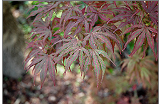
Mikazuki Japanese Maple foliage