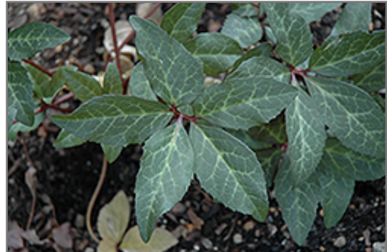
Merlin Hellebore foliage