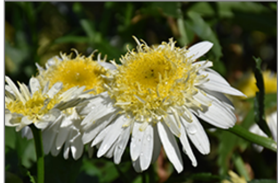
Realflor Real Glory Shasta Daisy flowers

Realflor Real Glory Shasta Daisy is recommended for the following landscape applications;