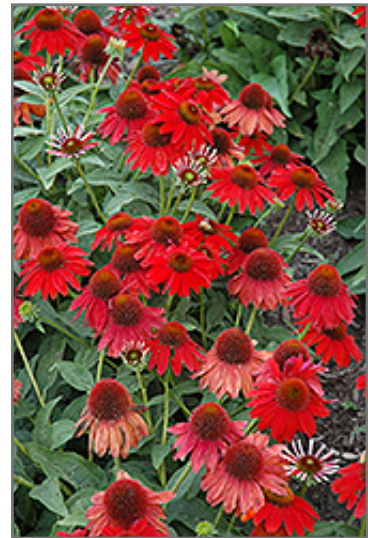
Sombrero Salsa Red Coneflower flowers

Sombrero Salsa Red Coneflower is recommended for the following landscape applications;