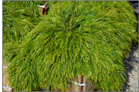
Cousin Itt Little River Wattle

Cousin Itt Little River Wattle is recommended for the following landscape applications;