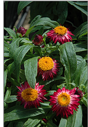
Mohave Dark Red Strawflower flowers