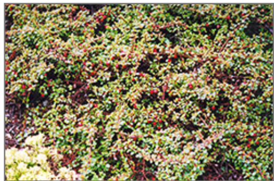
Streib's Findling Cotoneaster fruit