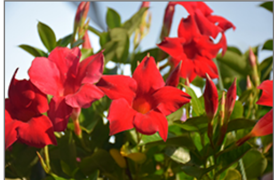
Sun Parasol Crimson Mandevilla flowers

This tropical plant does best in full sun to partial shade. It requires an evenly moist well-drained soil for optimal growth. It is not particular as to soil type or pH. It is highly tolerant of urban pollution and will even thrive in inner city environments. This particular variety is an interspecific hybrid, and parts of it are known to be toxic to humans and animals, so care should be exercised in planting it around children and pets. It can be propagated by cuttings; however, as a cultivated variety, be aware that it may be subject to certain restrictions or prohibitions on propagation.