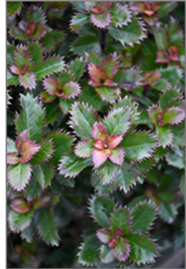
Scallywag Holly foliage