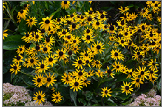
Little Goldstar Coneflower in bloom

This is a relatively low maintenance plant, and should be cut back in late fall in preparation for winter. It is a good choice for attracting butterflies to your yard, but is not particularly attractive to deer who tend to leave it alone in favor of tastier treats. It has no significant negative characteristics.