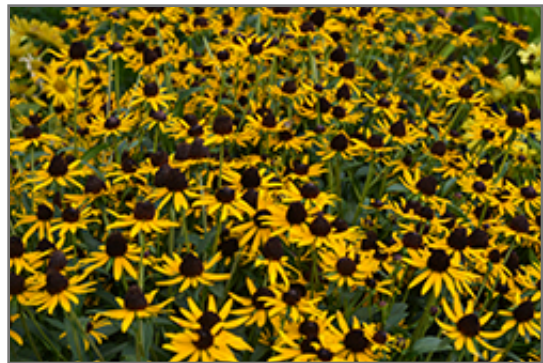
Little Goldstar Coneflower flowers