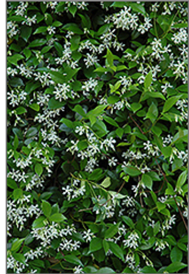
Confederate Star-Jasmine flowers