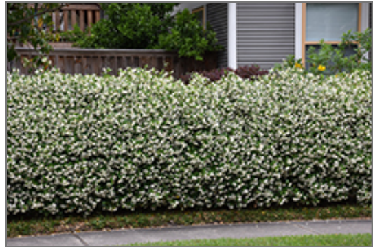
Confederate Star-Jasmine in bloom