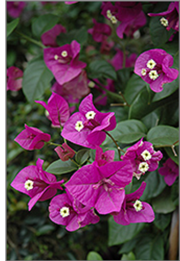
Purple Queen Bougainvillea flowers