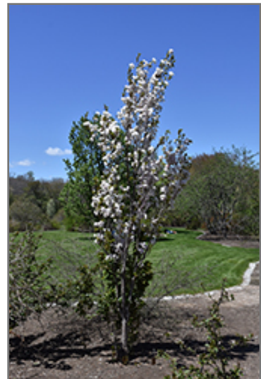
Amanogawa Flowering Cherry in bloom