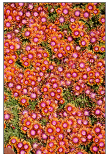
Fire Spinner Ice Plant flowers