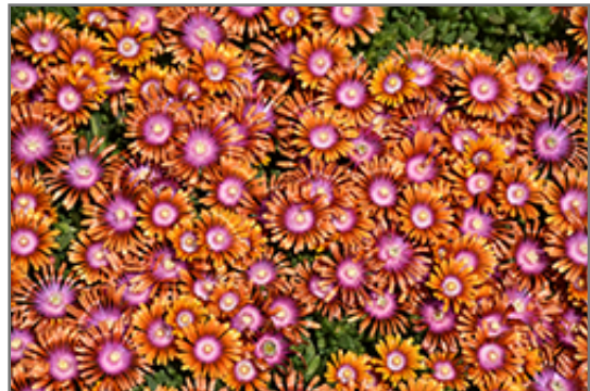
Fire Spinner Ice Plant in bloom

Fire Spinner Ice Plant is recommended for the following landscape applications;