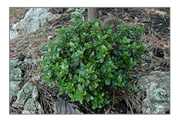
Little Rascal Meserve Holly