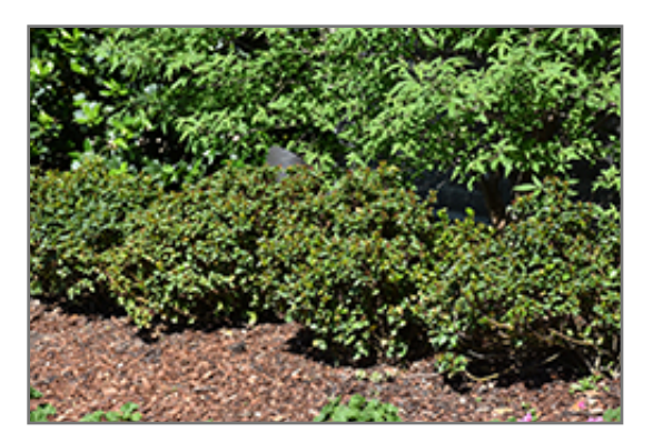
Little Rascal Meserve Holly

This shrub does best in full sun to partial shade. You may want to keep it away from hot, dry locations that receive direct afternoon sun or which get reflected sunlight, such as against the south side of a white wall. It requires an evenly moist well-drained soil for optimal growth, but will die in standing water. It is very fussy about its soil conditions and must have rich, acidic soils to ensure success, and is subject to chlorosis (yellowing) of the foliage in alkaline soils. It is somewhat tolerant of urban pollution. Consider applying a thick mulch around the root zone in winter to protect it in exposed locations or colder microclimates. This particular variety is an interspecific hybrid.