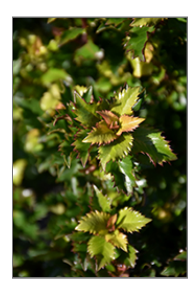
Little Rascal Meserve Holly foliage