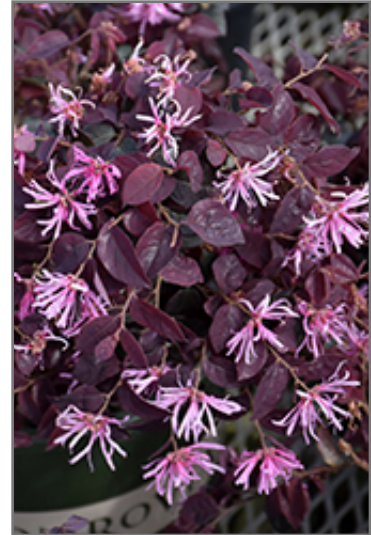
Sizzling Pink Chinese Fringeflower flowers