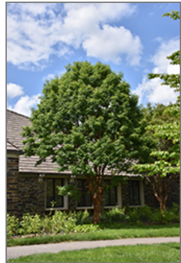
Paperbark Maple