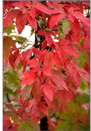
Paperbark Maple in fall

This tree does best in full sun to partial shade. It prefers to grow in average to moist conditions, and shouldn't be allowed to dry out. It is not particular as to soil type or pH. It is somewhat tolerant of urban pollution. This species is not originally from North America.