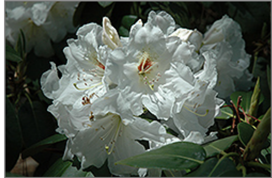
Dora Amateis Rhododendron flowers

A stunning variety with dainty small white blooms accented with faint yellow-green spots; an unusually dense showy accent plant with small twisted leaves; must have well-drained, highly acidic and organic soil, use plenty of peat moss when planting