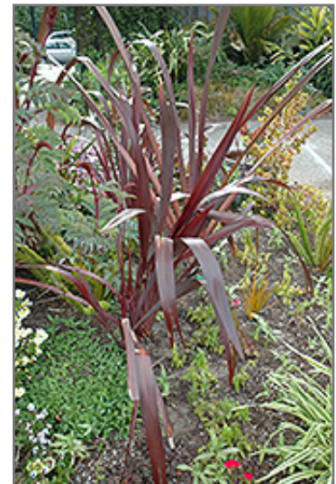
Amazing Red New Zealand Flax foliage