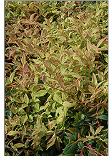
Gulf Stream Dwarf Nandina foliage