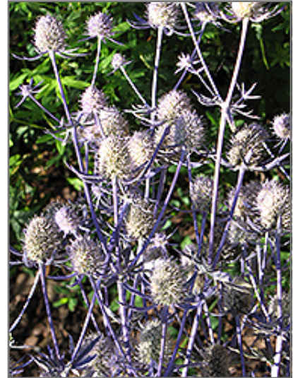
Jade Frost Variegated Sea Holly flowers

Jade Frost Variegated Sea Holly will grow to be about 8 inches tall at maturity extending to 24 inches tall with the flowers, with a spread of 15 inches. When grown in masses or used as a bedding plant, individual plants should be spaced approximately 12 inches apart. Its foliage tends to remain low and dense right to the ground. It grows at a medium rate, and under ideal conditions can be expected to live for approximately 10 years. As an herbaceous perennial, this plant will usually die back to the crown each winter, and will regrow from the base each spring. Be careful not to disturb the crown in late winter when it may not be readily seen!