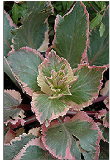
Jade Frost Variegated Sea Holly foliage