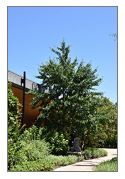
Autumn Gold Ginkgo