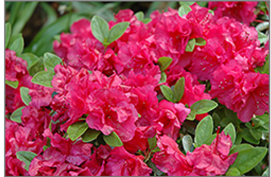
Nico Azalea flowers

Striking hot pink and cherry red blooms adorn this vigorous and hardy variety in mid spring; an accent shrub that will definitely make an impact along borders; absolutely must have well-drained, highly acidic and organic soil