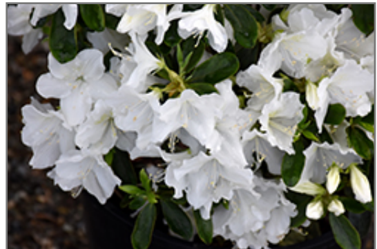
Hino White Azalea flowers