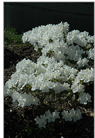
Hino White Azalea flowers