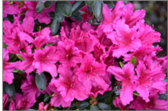
Girard's Fuchsia Evergreen Azalea flowers