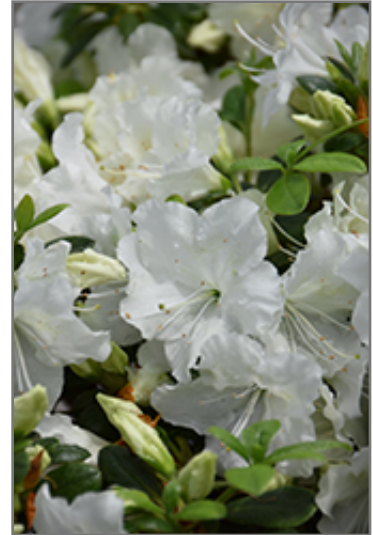
Everest Azalea flowers

Everest Azalea will grow to be about 6 feet tall at maturity, with a spread of 6 feet. It has a low canopy with a typical clearance of 1 foot from the ground, and is suitable for planting under power lines. It grows at a slow rate, and under ideal conditions can be expected to live for 40 years or more.