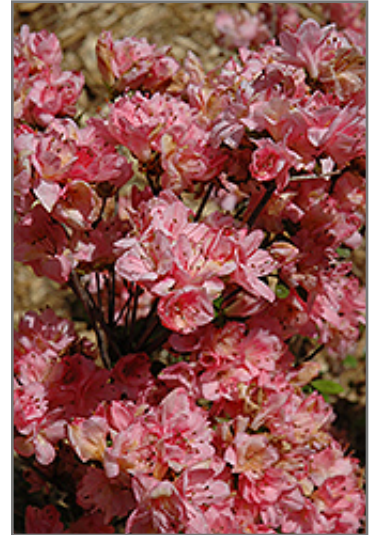
Caroline Gable Azalea flowers

Caroline Gable Azalea will grow to be about 5 feet tall at maturity, with a spread of 5 feet. It tends to be a little leggy, with a typical clearance of 1 foot from the ground, and is suitable for planting under power lines. It grows at a slow rate, and under ideal conditions can be expected to live for 40 years or more.