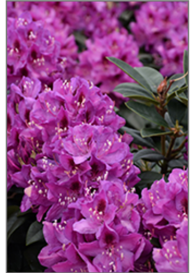
Anah Kruschke Rhododendron flowers

Anah Kruschke Rhododendron will grow to be about 5 feet tall at maturity, with a spread of 5 feet. It tends to be a little leggy, with a typical clearance of 1 foot from the ground, and is suitable for planting under power lines. It grows at a slow rate, and under ideal conditions can be expected to live for 40 years or more.