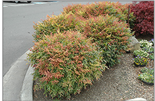
Sienna Sunrise Nandina