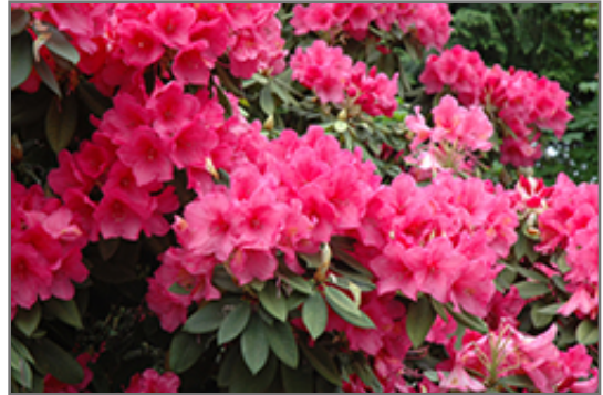
Anna Rose Whitney Rhododendron flowers