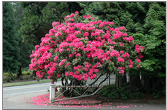
Anna Rose Whitney Rhododendron in bloom