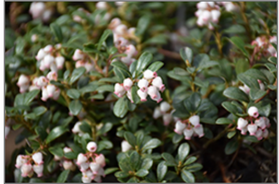
Massachusetts Bearberry flowers

Massachusetts Bearberry will grow to be about 12 inches tall at maturity, with a spread of 4 feet. It tends to fill out right to the ground and therefore doesn't necessarily require facer plants in front. It grows at a slow rate, and under ideal conditions can be expected to live for approximately 20 years.