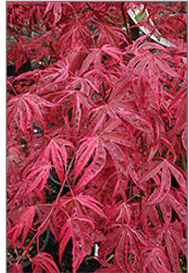
Shirazz Japanese Maple foliage