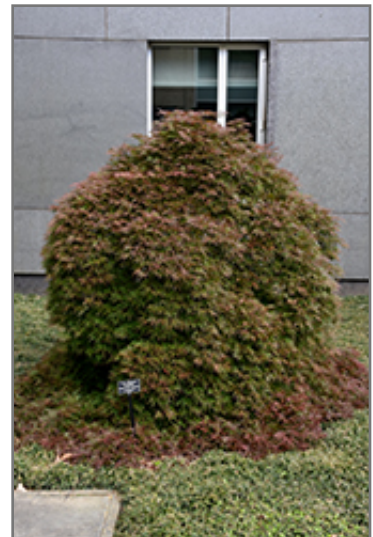
Orangeola Cutleaf Japanese Maple