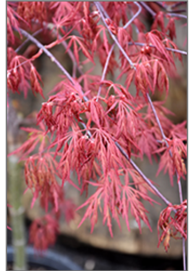
Orangeola Cutleaf Japanese Maple foliage

Orangeola Cutleaf Japanese Maple is a fine choice for the yard, but it is also a good selection for planting in outdoor pots and containers. Because of its height, it is often used as a 'thriller' in the 'spiller-thriller-filler' container combination; plant it near the center of the pot, surrounded by smaller plants and those that spill over the edges. It is even sizeable enough that it can be grown alone in a suitable container. Note that when grown in a container, it may not perform exactly as indicated on the tag - this is to be expected. Also note that when growing plants in outdoor containers and baskets, they may require more frequent waterings than they would in the yard or garden.