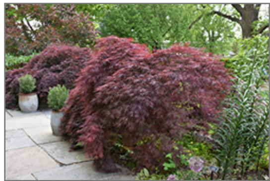
Crimson Queen Japanese Maple