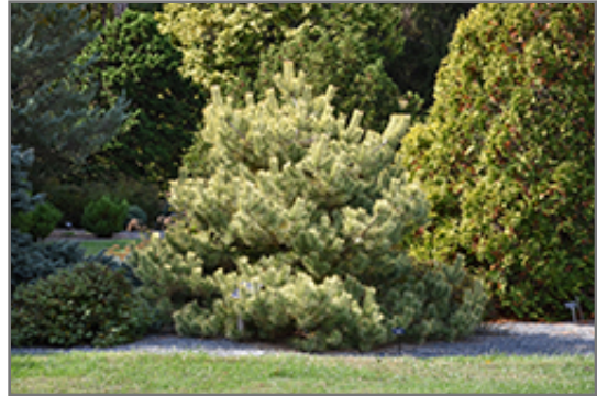
Gold Coin Scotch Pine

Gold Coin Scotch Pine will grow to be about 20 feet tall at maturity, with a spread of 15 feet. It has a low canopy with a typical clearance of 1 foot from the ground, and is suitable for planting under power lines. It grows at a medium rate, and under ideal conditions can be expected to live for 60 years or more.