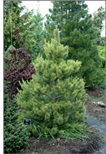
Gold Coin Scotch Pine

This is a relatively low maintenance tree. When pruning is necessary, it is recommended to only trim back the new growth of the current season, other than to remove any dieback. Deer don't particularly care for this plant and will usually leave it alone in favor of tastier treats. It has no significant negative characteristics.