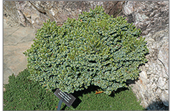
Pimoko Spruce