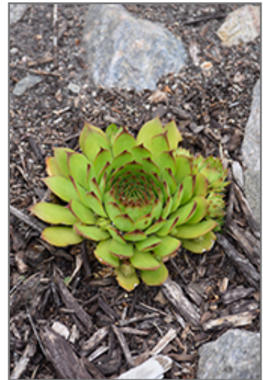
Sunset Hens And Chicks