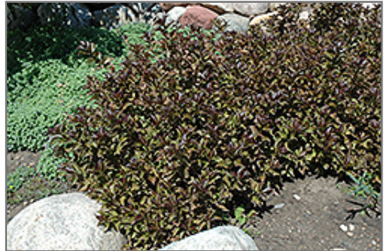
Dark Horse Weigela