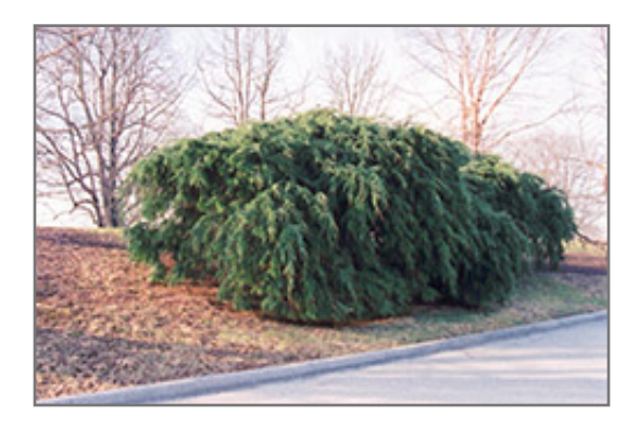
Sargent's Weeping Hemlock

Sargent's Weeping Hemlock is recommended for the following landscape applications;