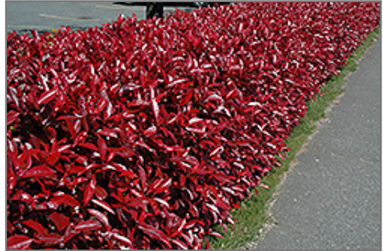
Fraser Photinia

This shrub performs well in both full sun and full shade. However, you may want to keep it away from hot, dry locations that receive direct afternoon sun or which get reflected sunlight, such as against the south side of a white wall. It is very adaptable to both dry and moist growing conditions, but will not tolerate any standing water. It is not particular as to soil type or pH. It is highly tolerant of urban pollution and will even thrive in inner city environments. This particular variety is an interspecific hybrid.