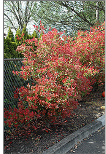
Fraser Photinia in bloom

Fraser Photinia is recommended for the following landscape applications;