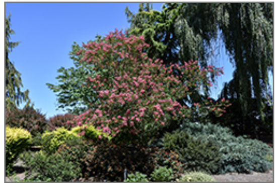
Pecos Crapemyrtle in bloom

Pecos Crapemyrtle is recommended for the following landscape applications;