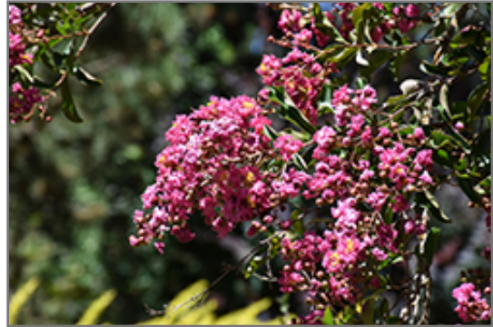
Pecos Crapemyrtle flowers

Pecos Crapemyrtle will grow to be about 12 feet tall at maturity, with a spread of 10 feet. It has a low canopy with a typical clearance of 1 foot from the ground, and is suitable for planting under power lines. It grows at a medium rate, and under ideal conditions can be expected to live for approximately 20 years.