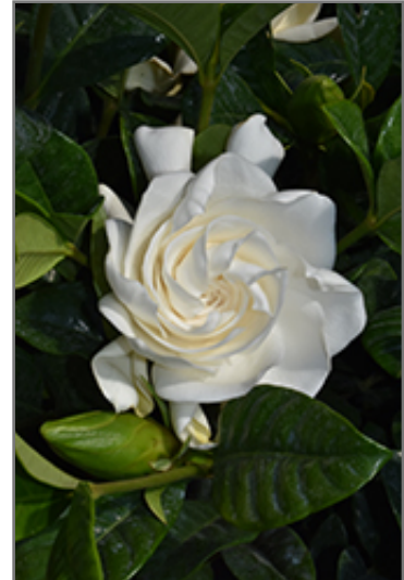
Aimee Gardenia flowers

Aimee Gardenia will grow to be about 8 feet tall at maturity, with a spread of 6 feet. It has a low canopy, and is suitable for planting under power lines. It grows at a slow rate, and under ideal conditions can be expected to live for approximately 30 years.