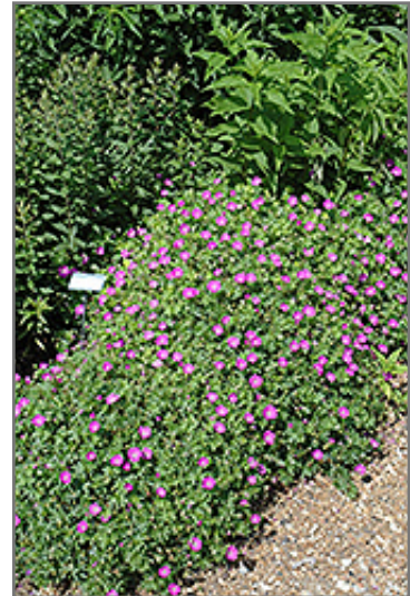
Max Frei Cranesbill in bloom