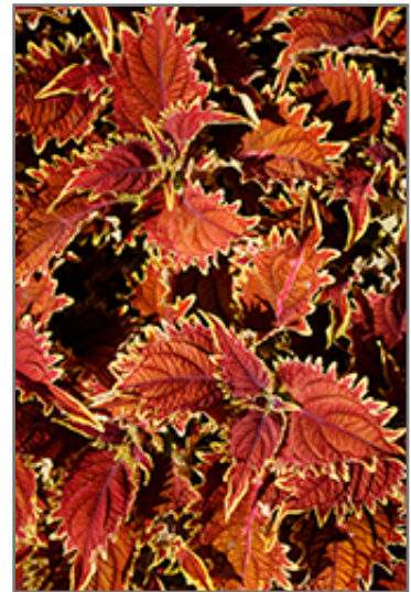
Copperhead Coleus foliage