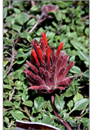
Marian Sampson Scarlet Monardella flowers

Marian Sampson Scarlet Monardella is recommended for the following landscape applications;