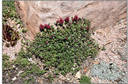
Marian Sampson Scarlet Monardella in bloom

Marian Sampson Scarlet Monardella will grow to be only 3 inches tall at maturity extending to 5 inches tall with the flowers, with a spread of 12 inches. When grown in masses or used as a bedding plant, individual plants should be spaced approximately 8 inches apart. Its foliage tends to remain low and dense right to the ground. It grows at a medium rate, and under ideal conditions can be expected to live for approximately 3 years. As an evergreen perennial, this plant will typically keep its form and foliage year-round.