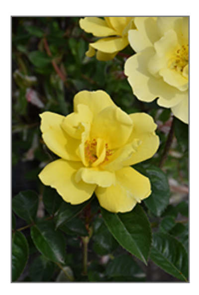
Grace N' Grit Yellow Rose flowers

This is a high maintenance shrub that will require regular care and upkeep, and is best pruned in late winter once the threat of extreme cold has passed. Gardeners should be aware of the following characteristic(s) that may warrant special consideration;