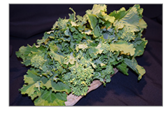
Sorrento Broccoli Raab fruit

Fast growing and early maturing, this variety produces tall plants that do well in home and market gardens; slender and tender stems produces uniform dark green florets; slightly bitter and nutty, delicious steamed, sauteed, or added to salads