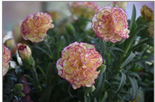
Flow Grace Bay Carnation flowers